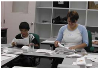
Students and casual workers folding EN information flyers.

Having established our office, it was time to tell the vastly spread out population of Nunavut that we were open for business. As it was too late to get our contact information in the upcoming phone book we chose to advertise on the plastic phone book covers distributed throughout Nunavut. For a small additional fee we were able to insert flyers with all our essential information. We printed - and students folded 20,000 of these flyers.